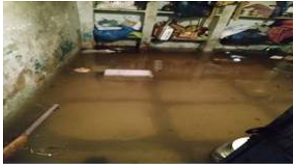
Water entering Streets and Houses