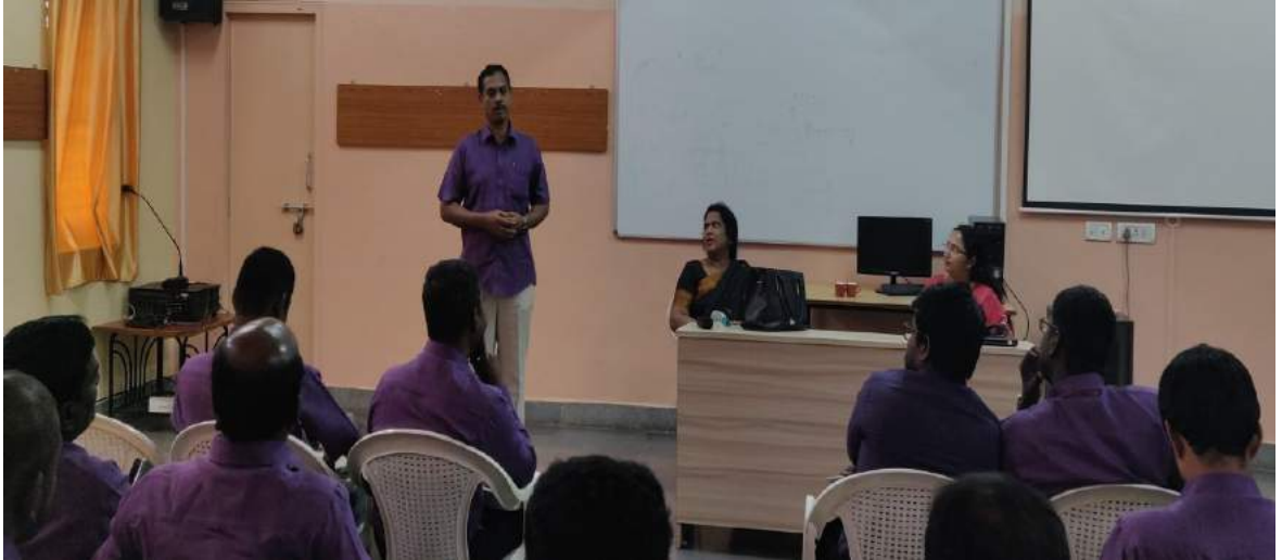
- British High Commissioner visited HMI