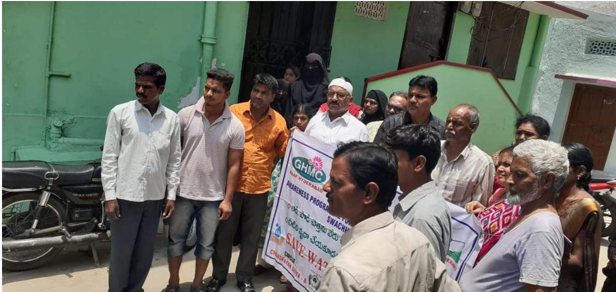
Community Men & Women participation in Cleanliness. Save Water Campaign