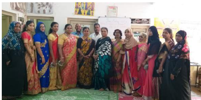
Teachers Day Celebration