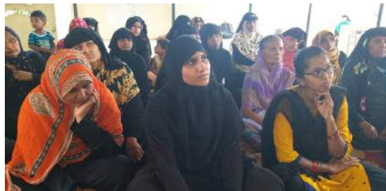
Parents Orientation Programme