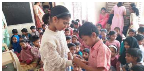
Friendship Day Celebration at School