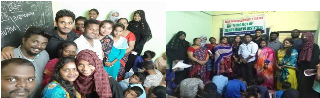
Students interacting with the children